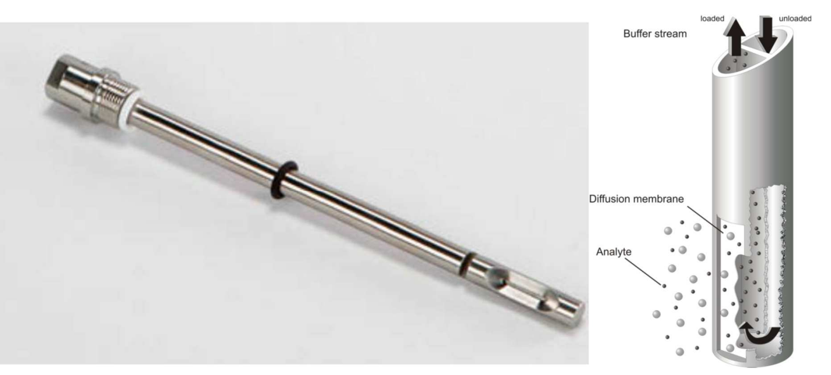
Figure 2. Dialysis probe

For connecting the device to the process, the patented dialysis probe (figure 2), the filtration probe, or the single-use dialysis probe are optional available. Therefore the TRACE C2 Control can be connected to common glass and stainless steel fermenters as well as to novel single use bioreactors.