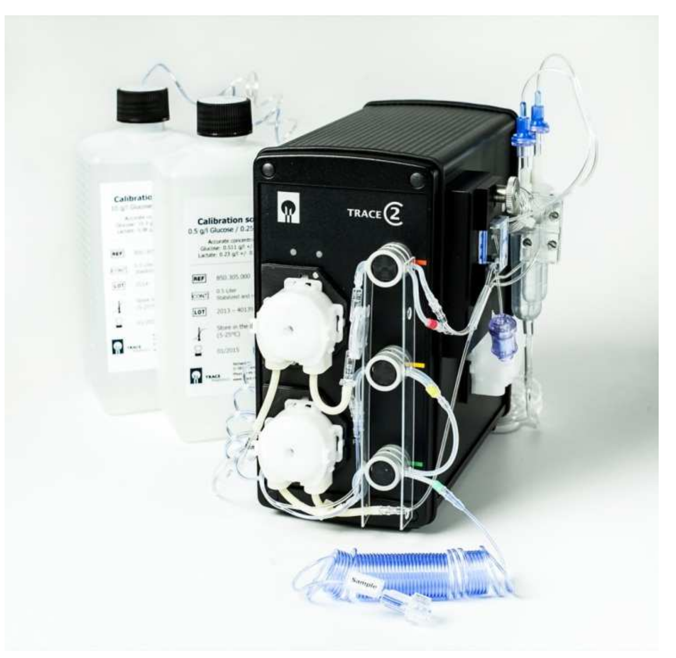
Figure 1. TRACE C2 Control

TRACE C2 Control is a new online analyzer for controlling the glucose concentration (figure 1).